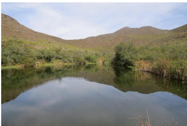
ONE OF THE DAMS ON THE FARM