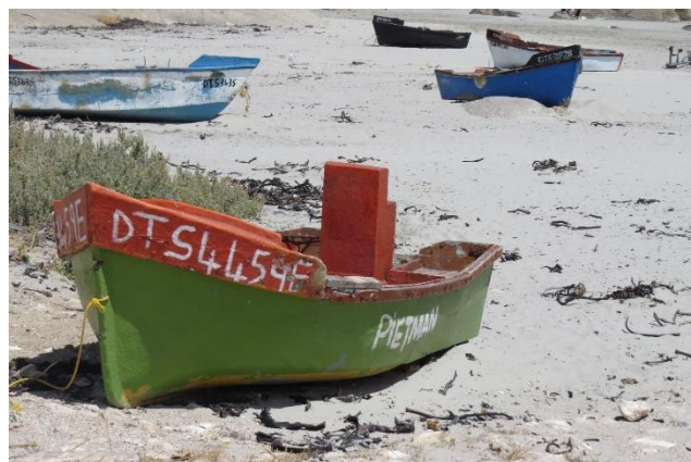
FISHING BOATS ON THE BEACH

We leave Cape Town and drive to Yzerfontein for a short coffee break. Thereafter we continue via Langebaan and Saldanha Bay to Paternoster where we will be spending two nights at the very comfortable Mosselbank Guest House. We will enjoy great meals at local restaurants. While at Paternoster we will visit Velddrif, where we will take a morning cruise on the Berg River. On the last day we visit Cape Columbine and local attractions. We return to the city via Hopefield and Malmesbury.