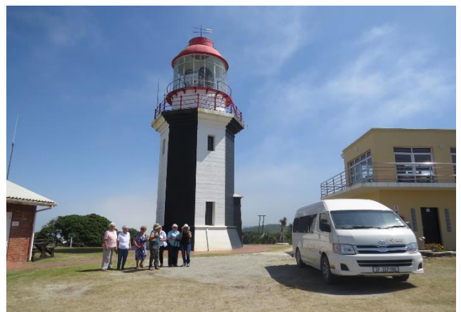
THE GREAT FISH RIVER LIGHTHOUSE

The first lighthouse we visit is the Danger Point Lighthouse. We overnight at Kleinbaai. Then on to Mossel Bay and the Cape St Blaize Lighthouse. Now we travel to St Francis Bay where we visit the lighthouse and the Sea Bird Rescue Centre. Our journey continues as we pass Port Elizabeth, and leaving the N2 we travel via Alexandria and Port Alfred to the Great Fish River. Here we will stay at the lighthouse cottages. The lighthouse is situated on top of a hill overlooking the ocean with spectacular views. The accommodation consists of beautifully renovated staff houses. The rooms are very comfortable but sharing of bathrooms will be a necessity. We return to the N2 and retrace our steps past Port Elizabeth, following the Langkloof and on to Oudtshoorn for the evening. We complete the journey back to Cape Town via Montagu and Robertson.