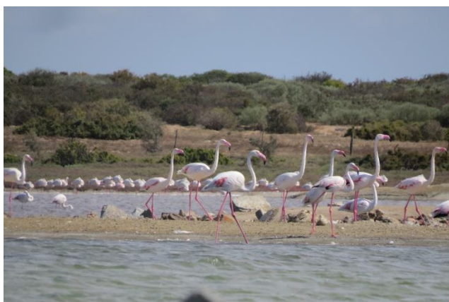
FLAMINGOES SEEN FROM THE BOAT CRUISE ON THE BERG RIVER