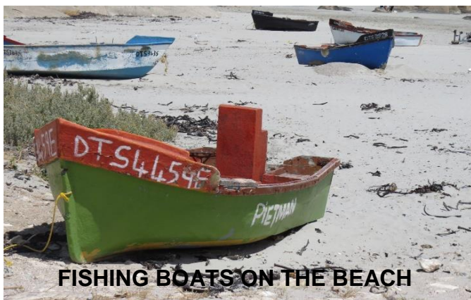
FISHING BOATS ON THE BEACH

We leave Cape Town and drive to Yzerfontein for a short coffee break. Thereafter we continue via Langebaan and Saldanha Bay to Paternoster where we will be spending two nights at the very comfortable Mosselbank Guest House. We will enjoy great meals at local restaurants. While at Paternoster we will visit Velddrif, where we will take a morning cruise on the Berg River. On the last day we visit Cape Columbine and local attractions. We return to the city via Hopefield and Malmesbury.