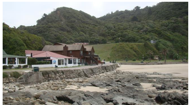
THE PROMENADE AT VICTORIA BAY