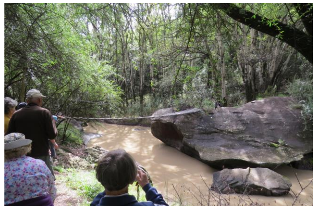
WALKING AT WYDNFORD