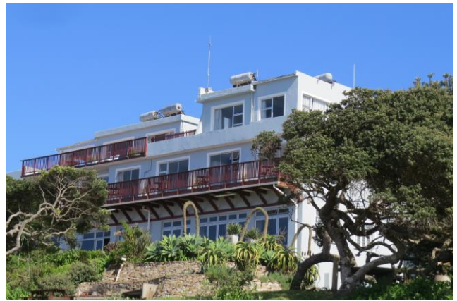
THE MORGAN BAY HOTEL

All our scheduled tours include home pick-ups within the Cape Peninsula and Somerset West area, transport with accredited tour guides, entrances to listed attractions, very good accommodation, teas where appropriate, lunches and dinners.