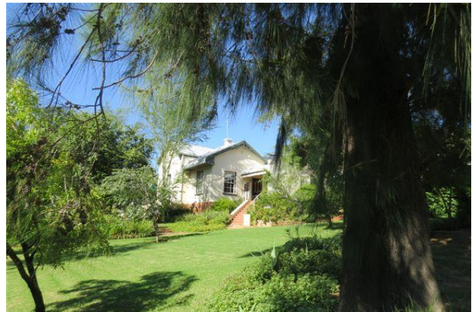
The main house at the Retreat at Groenfontein