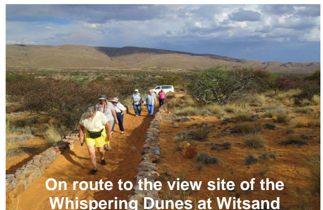
On route to the view site of the Whispering Dunes at Witsand