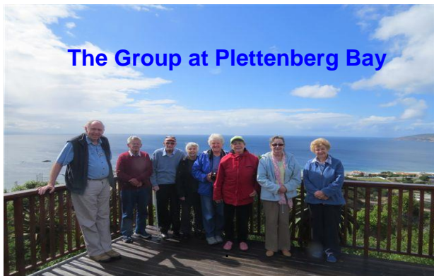
The Group at Plettenberg Bay