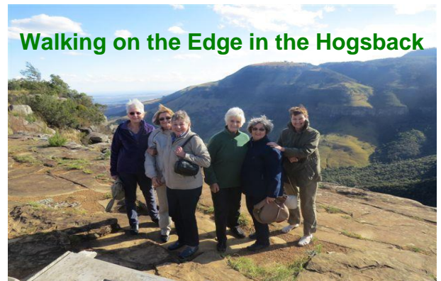
Walking on the Edge in the Hogsback