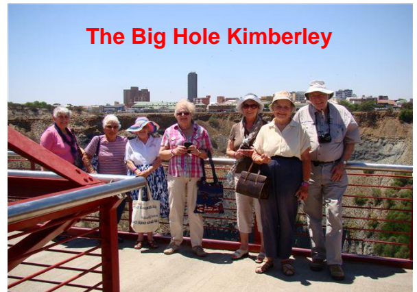
The Big Hole Kimberley